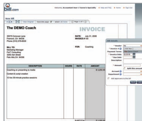
➤ Approval Window on Bill.com automatically routes bills for approval with just a few clicks. Users are set up with specific roles and access rights for better workflow controls.

Once the bill is scheduled for payment, Bill.com automatically sends the payment with a printed image of the invoice to the vendor, ensuring payment is applied correctly. Bill.com eliminates check printing, signing and mailing. Clients no longer have to provide their accounting professional with check stock. Each cashed check or online payment is stored indefinitely and mapped to the appropriate invoice for easy online viewing should questions about a payment arise.