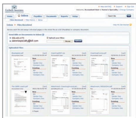
➤ Your Bill.com Inbox makes it easy to upload and access new client invoices and documents from a single screen.